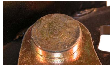
Improved Pivots !

These sets will fit any Opel GT, Manta, Ascona, Kadett or Wagon (equipped with a 1.9L driveline). Maybe best of all, no core fee or exchange is required!