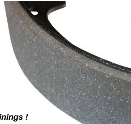
+ Better Linings !